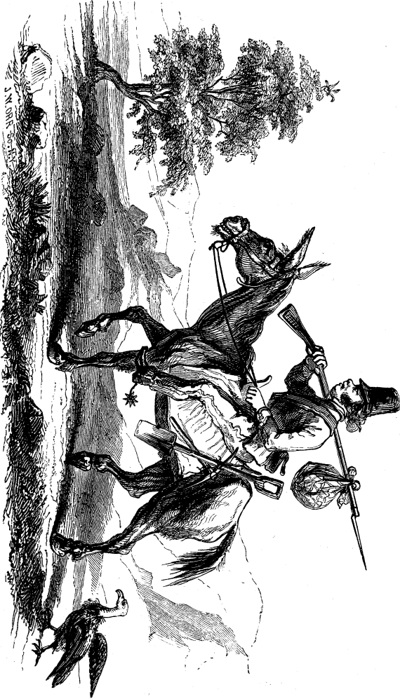
A United States deserter, from the fort at Monterey, on his way to the mines, upon the back of a mule which the Vulture claims.