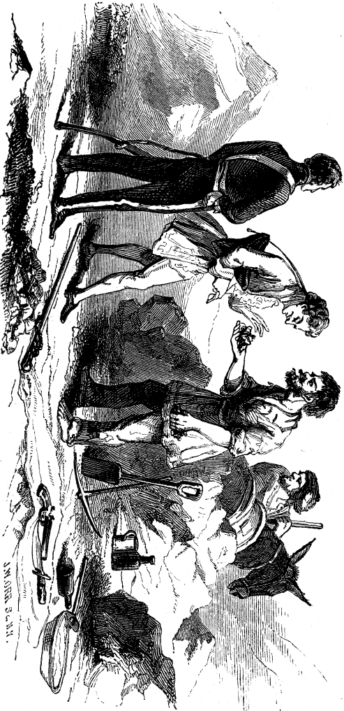
An Alcalde at the mines examining a lump of gold—catches the fever—drops his staff of office, and tells his sheriff to go home and hang the prisoner whom he left at the bar, and he will sentence him afterwards