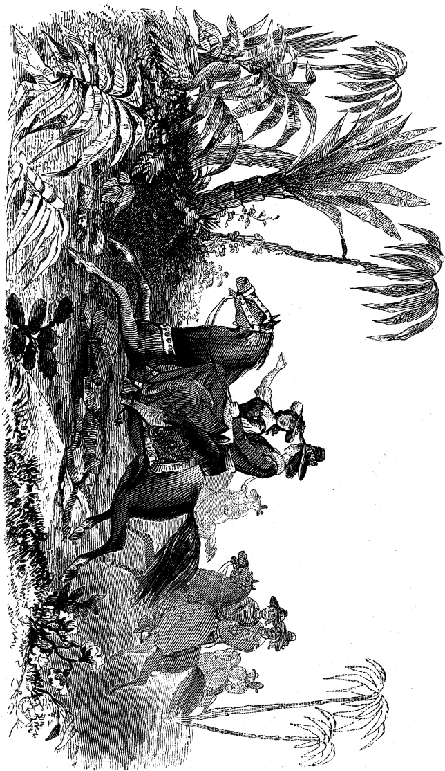
A California party on a Pic-nic excursion.